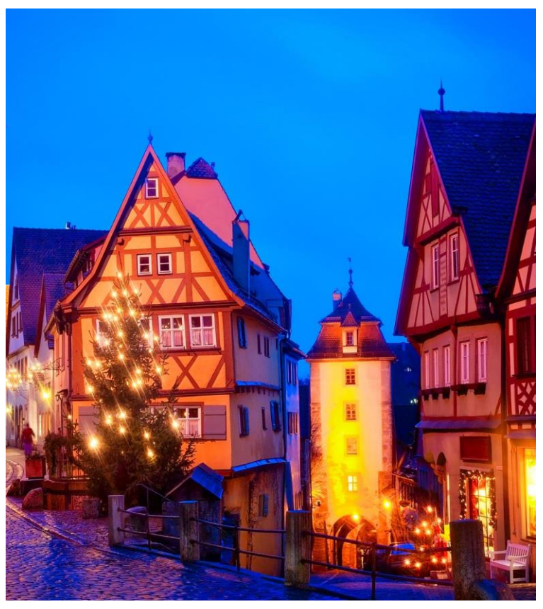
9 Days • 19 Meals: 7 Breakfasts, 5 Lunches, 7 Dinners

HIGHLIGHTS... Vienna, 6-Night Danube River Cruise, Wachau Valley, Glühwein Party, Choice on Tour: Passau City Walk or Veste Oberhaus Fortress, Passau, Regensburg, Nuremberg, Rothenburg, Würzburg, Christmas Markets